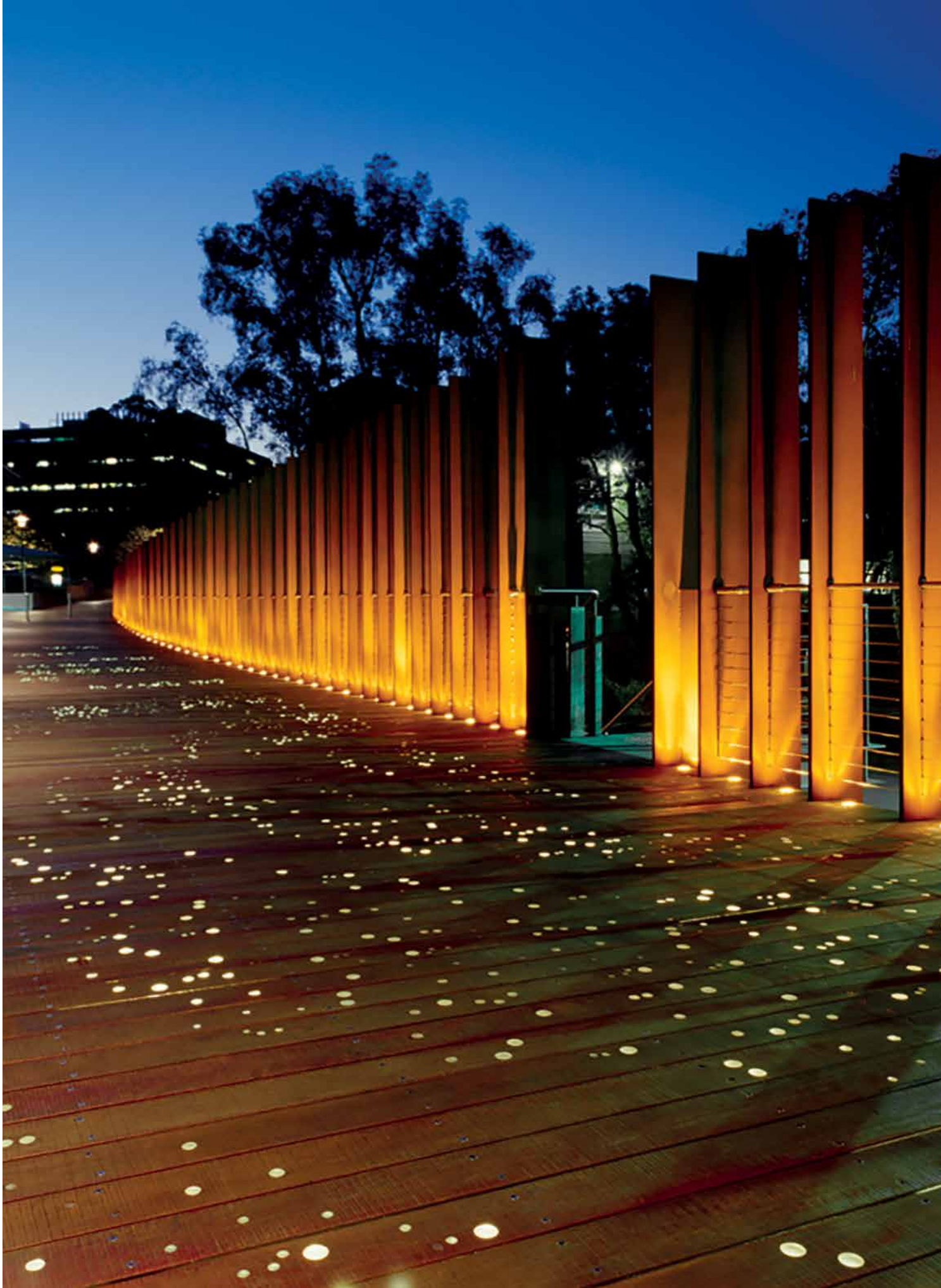
Image: Constellations represented by lights on the boardwalk to Redfern Station