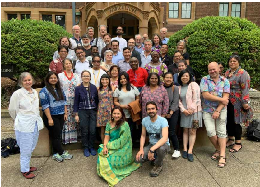
Image: Attendees at Sydney Knowledge Feast and Foundation for Endangered Languages Conference December 2019

The University is bound to meet targets in Aboriginal and Torres Strait Islander student numbers and Aboriginal and Torres Strait Islander community research under the Wingara Mura – Bunga Barrabugu Strategy, including to create an Indigenous research strategy for the University. Ngarangun builds on existing initiatives at the University, including the specifically Indigenous 'Wingara Mura – Bunga Barrabugu Strategy'. Ngarangun was developed by the University Executive Research Committee Indigenous Research Strategy Working Group following extensive consultation with Aboriginal and Torres Strait Islander communities in 2016-17.